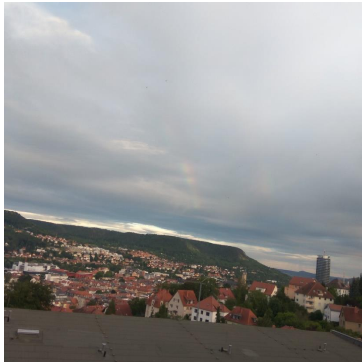
I was lucky enough to spot the first double rainbow* of my life at Jena!

*Double rainbow signifies future success and I am successful in the ongoing pandemic 2020. I am thankful to BARI and Leibniz-IPHT for made 2020 one of the invaluable years of my life!