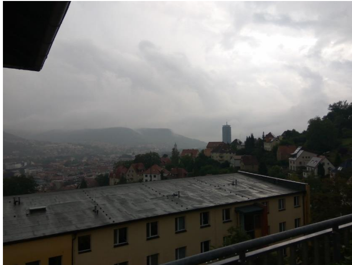
Jena city from my Johann-Griesbach-Strasse-7