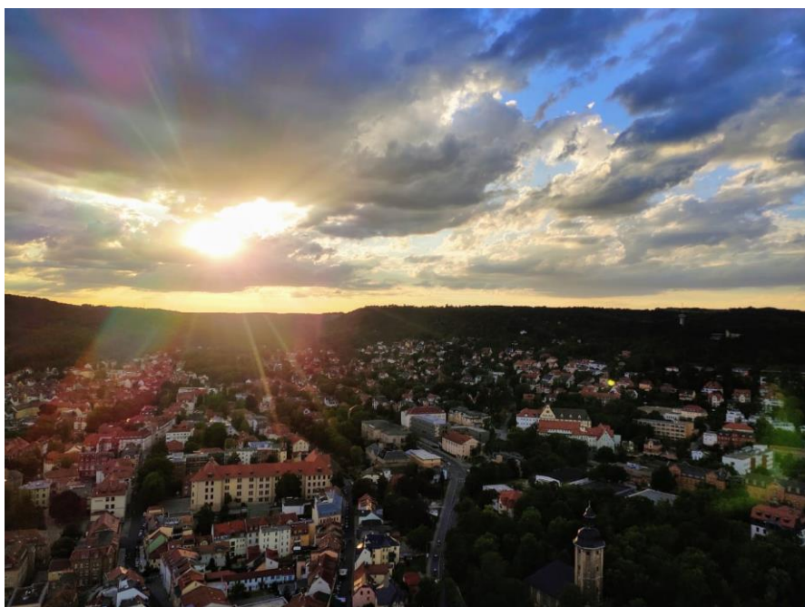
City of Jena from the Jen Tower